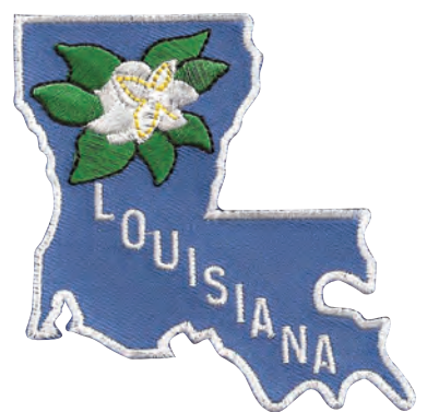
Hot Cut Border