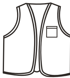
VB-1 1 CHEST POCKET