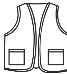
VB-3 2 LOW POCKETS

These bolero vests are casual and not form fitting. They are made to wear over other clothing, and are not made to come completely together in the front. Vests are custom made to your order and are not stocked, and cannot be returned, however if there is a problem with your order, please alert us within 2 weeks of receipt.