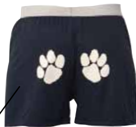
Transfer (Butt print)