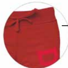
Athletic Pride Print